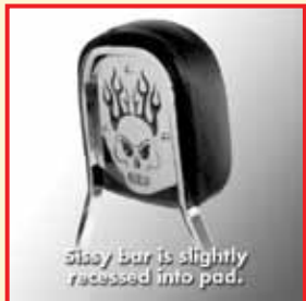
Sissy bar is slightly recessed into pad.

1/4" x 1-1/4" VTX Fits VTX 1300 & 1800 Sissy Bars.