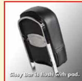
Sissy Bar is flush with pad.

1" Round Kawasaki Nomad Fits Nomad Sissy Bar.