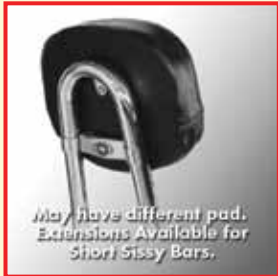
May have different pad. Extensions Available for Short Sissy Bars.

1/2" Round H-D Touring Style Fits H-D Detachable Sissy Bar.