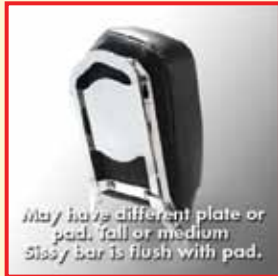
May have different plate or pad. Tall or medium Sissy Bar is flush with pad.

1/2" x 1/2" Square Fits many bikes. The height, width and size of pad may vary.