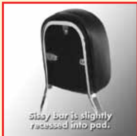
Sissy bar is slightly recessed into pad.

3/8" x 3/4" Cobra Rectangular Sissy Bar (With Plate) Fits many bikes. Sissy Bar is slightly recessed into pad.