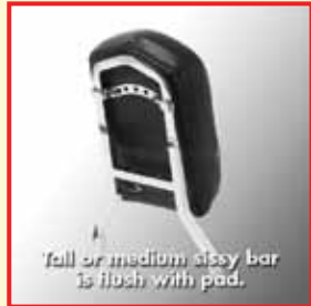
Tall or medium sissy bar is flush with pad.

Love Handles Armrests are available in designs to complement your bike ~ Classic Black, Studs, Flames, Fringe or a combination. All provide incredible comfort for your passenger. They come mostly assembled and take only 15 - 20 minutes to install with a few wrenches and a screwdriver. (Backrest not included. Sorry, no tour packs at this time).