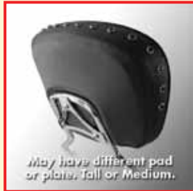
May have different pad or plate. Tall or Medium.

1/2" x 1/2" Square Medallion Style Fits many bikes. The height, width, design of plate and size of pad may vary.