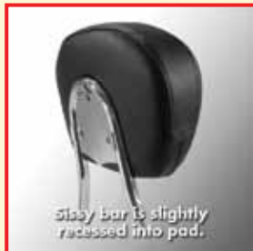
Sissy bar is slightly recessed into pad.

3/8" x 3/4" Cobra Rectangular Sissy Bar (Open) Fits many bikes. Sissy Bar is slightly recessed into pad.